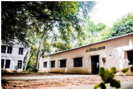
Table tennis, carrom, Chess.... Indoor games are provided in the college campus by the Dept. of Physical Education.

Facilities are provided for Outdoor games - cricket, athletics, kabaddi, kho – kho, basketball, badminton, football etc in our spacious grounds.