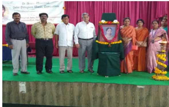
Auditorium with seating capacity of 800.