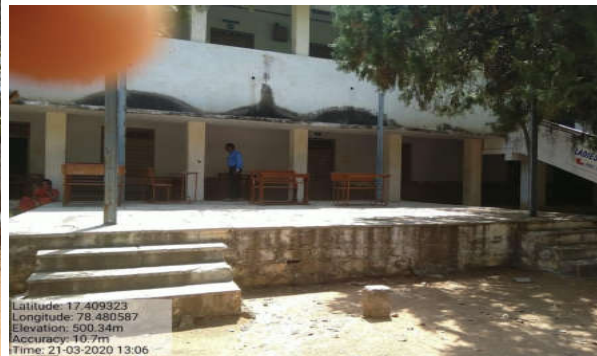
Open Stage- behind the main building