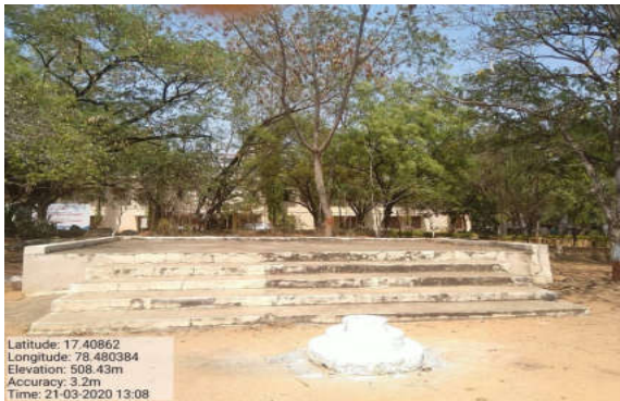
Open Stage - next to the volleyball court